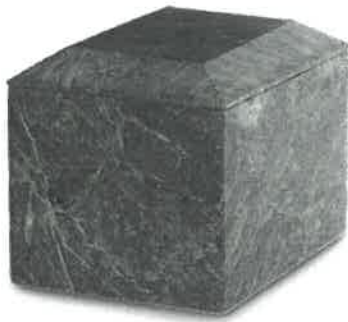
F Verde Marble