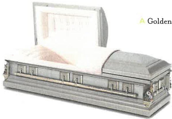
A Golden Rose