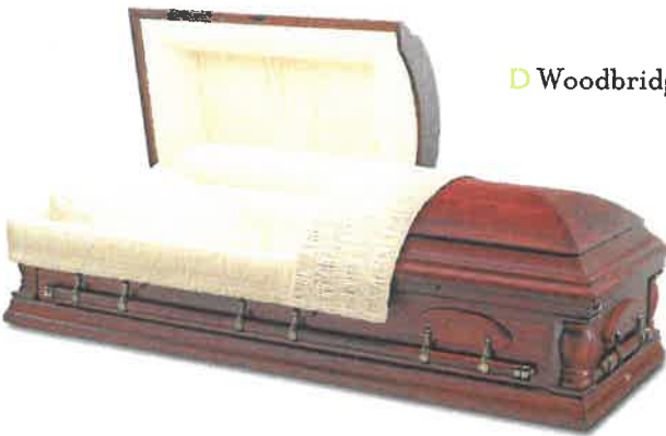
D Woodbridge Pecan