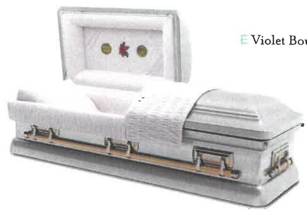
E Violet Bouquet