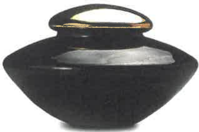
A Prague Bowl