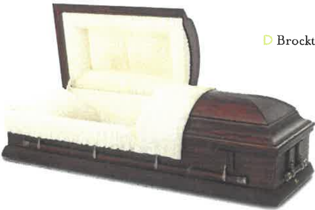
D Brockton Oak