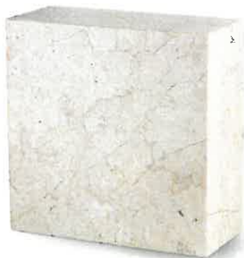
J Sand Rectangle