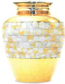
E Mother of Pearl Elite