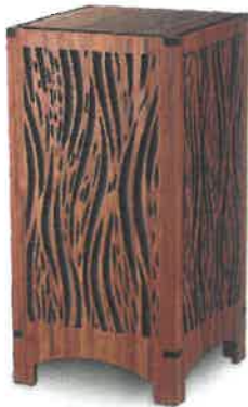
B Rippling Waters Bamboo™