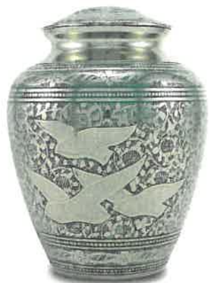
I Dove Vase