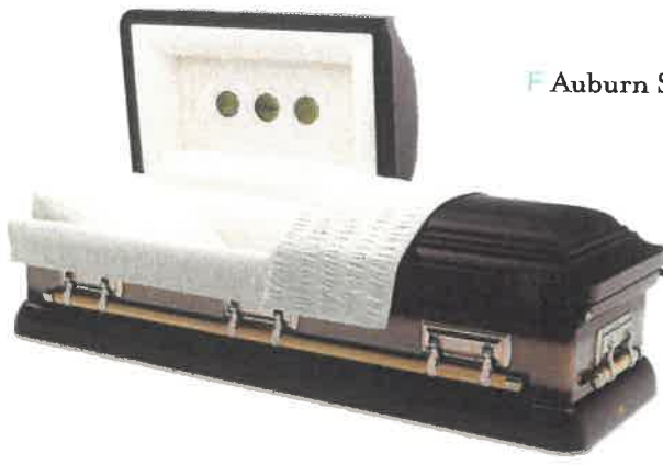
F Auburn Sunset