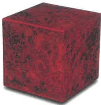
K Natural Cube