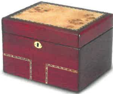
G Memento Chest