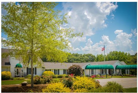
Hightower Funeral Home