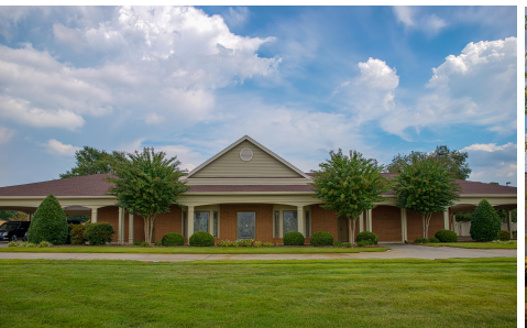
Martin & Hightower Heritage Chapel

1312 SOUTH PARK STREET CARROLLTON, GEORGIA 30117 770-836-1466 770-214-2607 www.martin-hightower.com