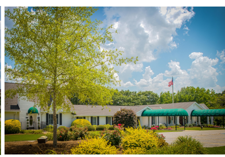
Hightower's Memorial Chapel

1312 SOUTH PARK STREET CARROLLTON, GEORGIA 30117 770-836-1466 770-214-2607 www.martin-hightower.com